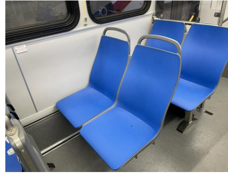
Contoured Plastic Seats