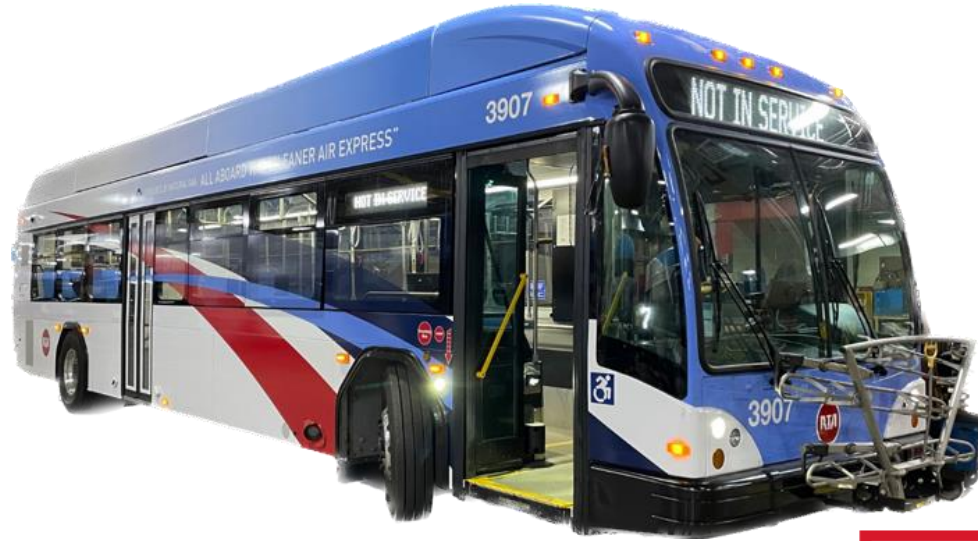
40' Gillig CNG Transit Bus

Greater Cleveland Regional Transit Authority