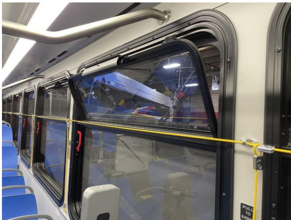
Tip-in Vented Windows