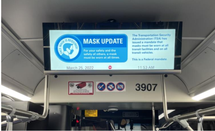
Passenger Information System