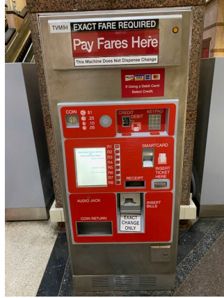
Ticket Vending Machine