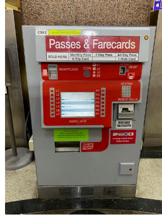
Customer Service Kiosk