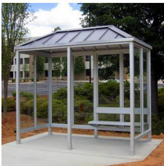
4. Slimline shelter with aluminum hip roof, silver, silver bench