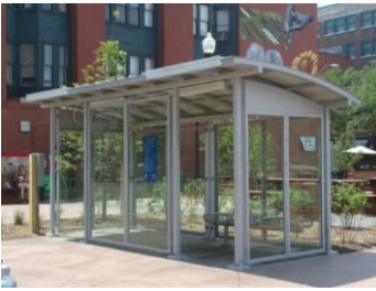
9. Transit Zone Shelter