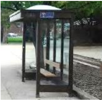
1. RTA shelter (extra small) with standard dome roof