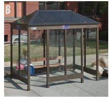
5. RTA shelter (medium) with acrylic hip roof, bronze

RTA is able to refurbish and improve its existing Brasco brand shelter stock to like-new conditions. We can paint shelters black or silver ( photo 2 ), and install several different pre-approved Brasco roof options ( photos 3-8 ) that are compatible with our standard shelters and offer similar weather protection. Solar lighting packages can also be purchased and maintained by partners.