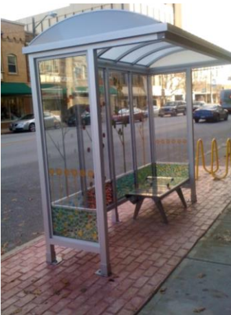
10. Detroit and Warren Transit Waiting Environment