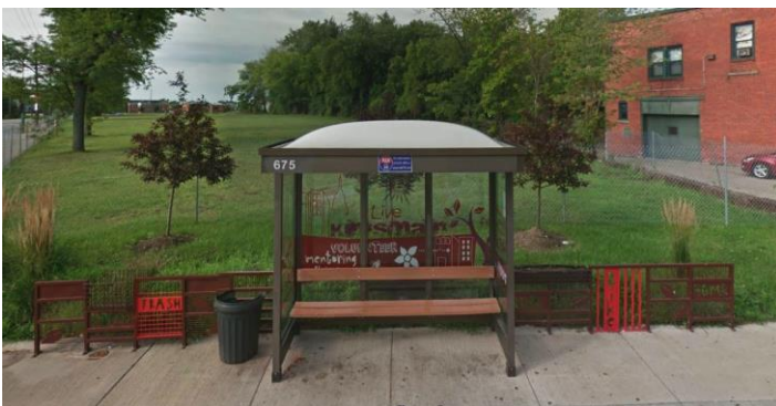
11. Kinsman and East 79th Transit Waiting Environment

For information on standard bus shelters and stop placement, please refer to the GCRTA Bus Stop Guidelines . For more ideas on transit waiting environment elements, see GCRTA's Transit Waiting Environment Ideabook for Making Better Bus Stops .