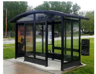
7. RTA-type shelter with standing seam aluminum reverse barrel roof, black, black bench