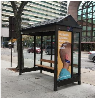
3. RTA shelter (small) with acrylic gable roof, black