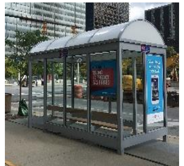
8. RTA shelter (medium) with acrylic barrel roof, silver