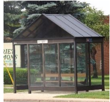
6. RTA shelter with reverse gable acrylic roof, bronze