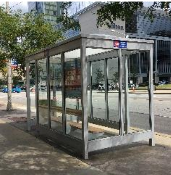
2. RTA shelter (medium) with standard dome roof, silver