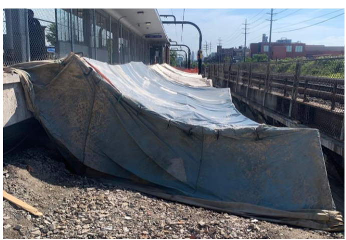
Greater Cleveland Regional Transit Authority