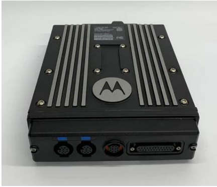
APX6500 Radio Chassis