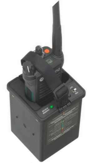
IMPRES Vehicle Charger

Greater Cleveland Regional Transit Authority