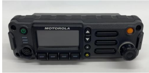
O2 Control Head